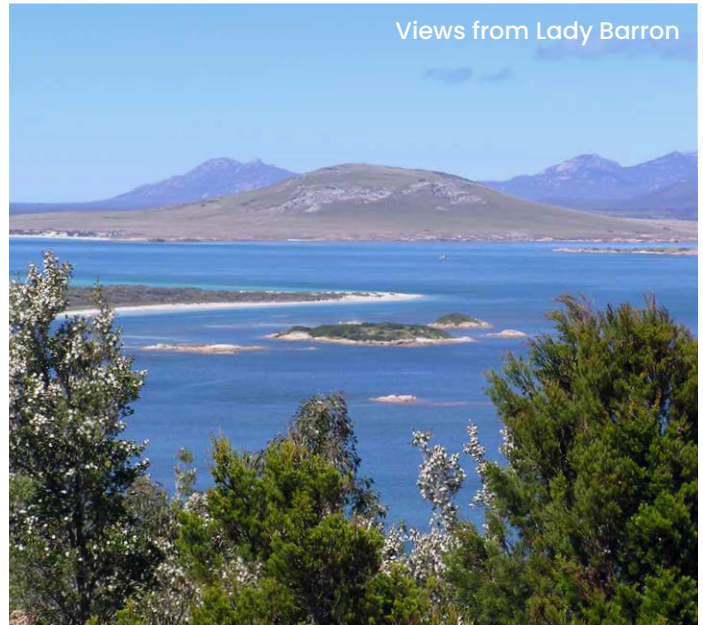
Views from Lady Barron

OVERNIGHT Lady Barron: The Furneaux Tavern