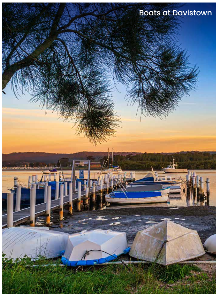
Boats at Davistown

OVERNIGHT & DINNER The Esplanade Resort & Spa