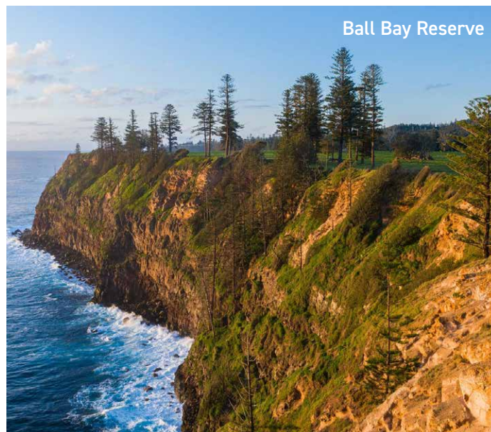
Ball Bay Reserve