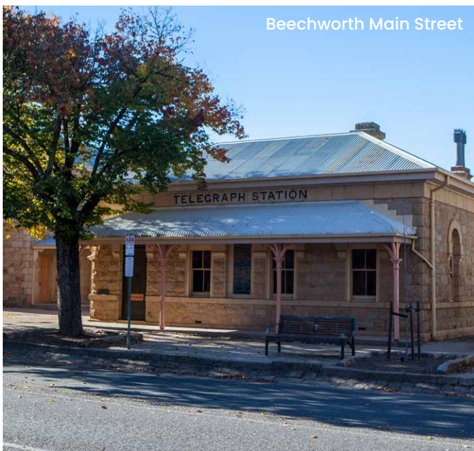
Beechworth Main Street

*Prices are based on twin share. Conditions apply. Insurance is strongly recommended.