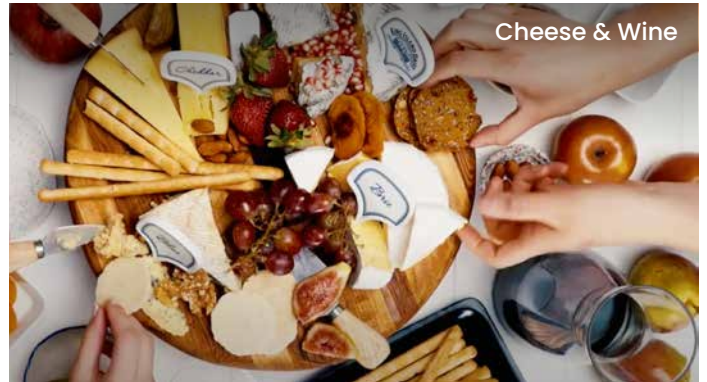
Cheese & Wine