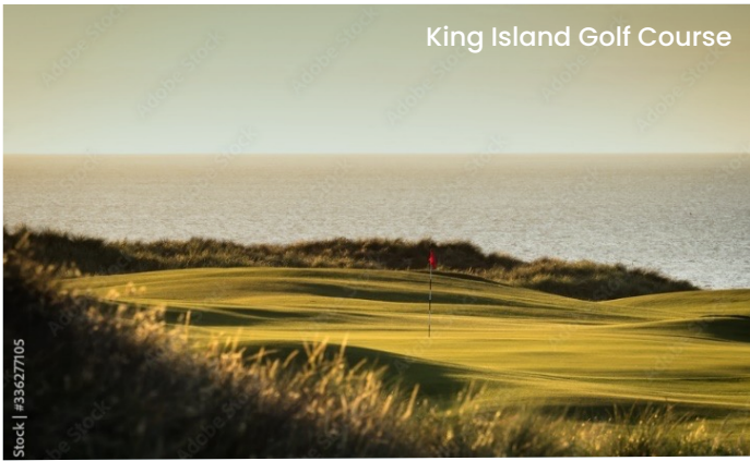
King Island Golf Course