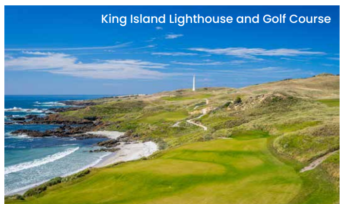
King Island Lighthouse and Golf Course