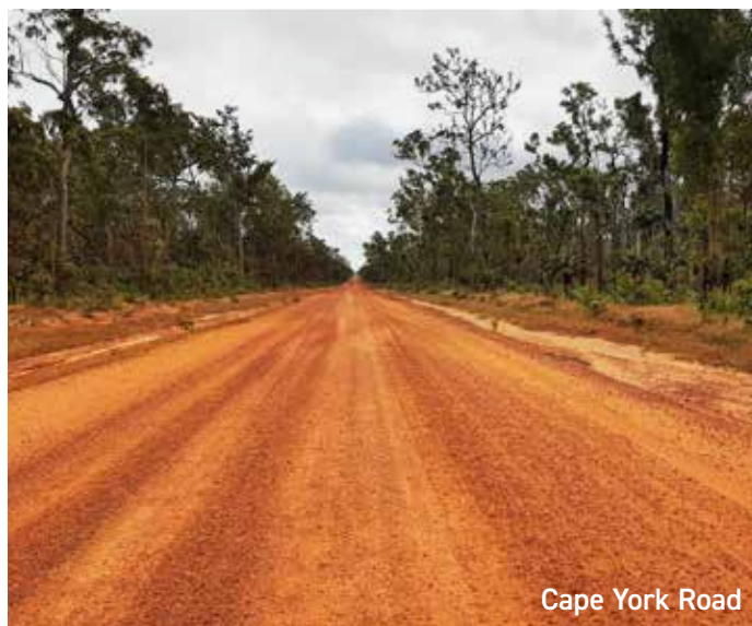
Cape York Road