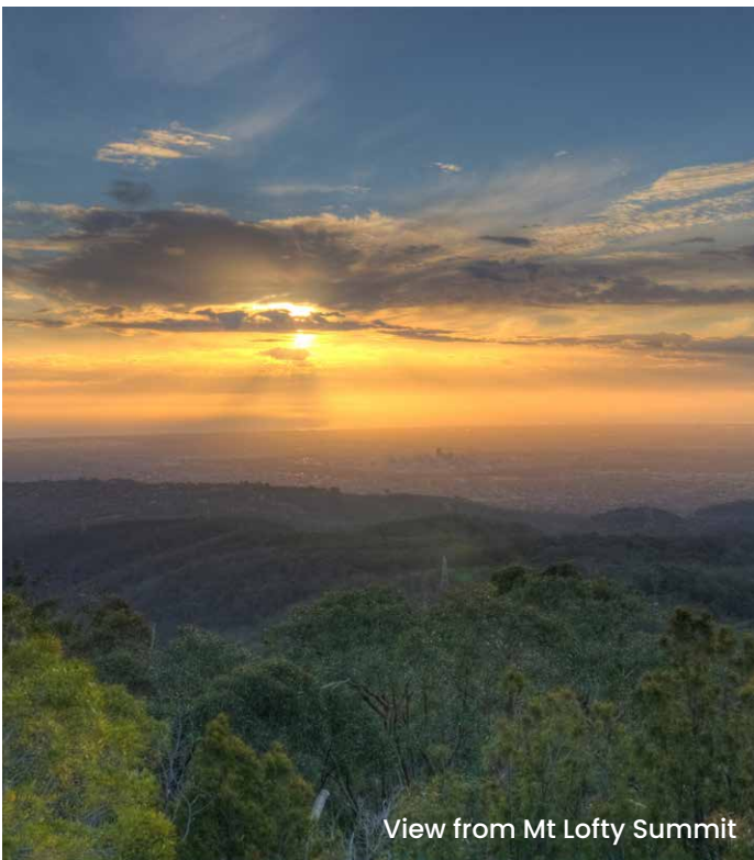
View from Mt Lofty Summit

*Prices are based on twin share. Conditions apply. Travel insurance is strongly recommended.