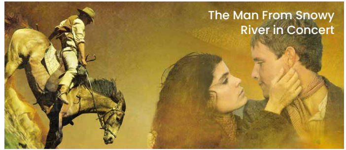
The Man From Snowy River in Concert

OVERNIGHT ibis Adelaide Hotel, 122 Grenfell Street Adelaide SA 5000, T (08) 8159 5588