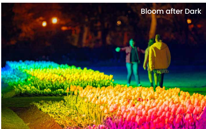
Bloom after Dark